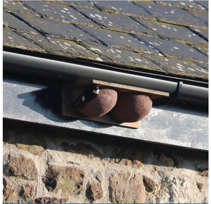
Meet the residents!