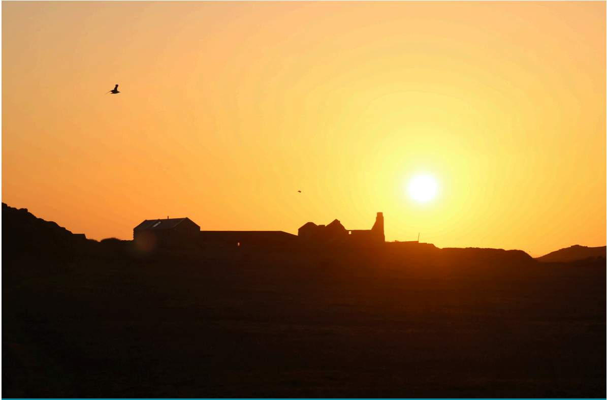
Spring sunset over the Farm - your home for the duration of your stay!

You will be staying in a converted old farm building nestled in the very heart of the island. Although basic, the hostel has everything you will need for the duration of your stay.