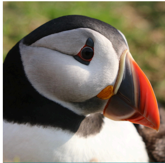
An ever-posing Atlantic Puffin