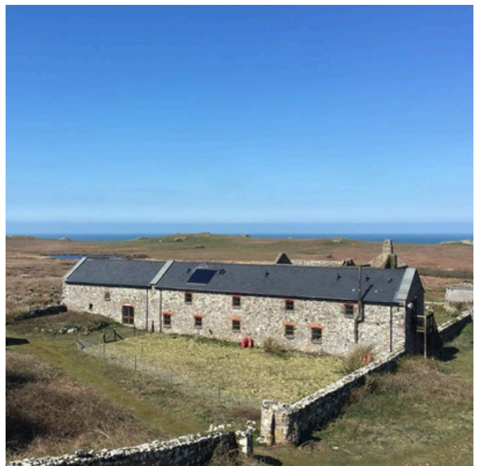
Our hostel accommodation

Up at the Farm, we unload your bags and get you settled in to the hostel. Once this is done, the island is yours to explore!