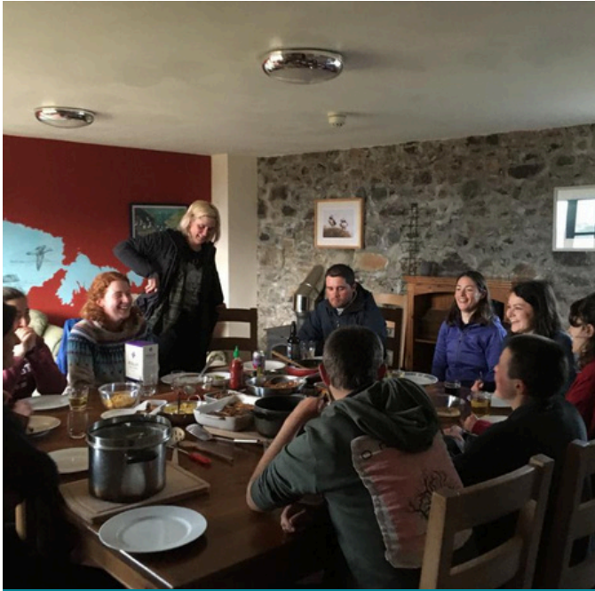
Plenty of room for everyone at dinner

Our spacious lounge doubles up as a dining room. Here you'll also find a comfortable sofa, and a log burner* - perfect to curl up in front of on a chilly evening!