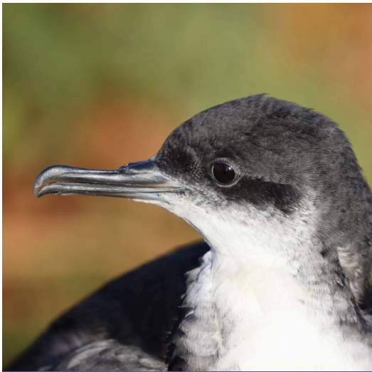
One of our elusive Manx Shearwaters

We ask all overnight guests and volunteers on Skomer and Skokholm to adhere to our biosecurity measures to help protect the islands from rats and other invasive species