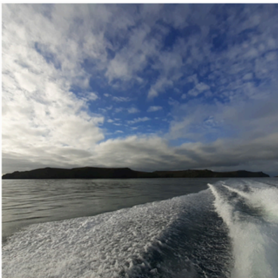
First glimpse of Skomer from the boat!