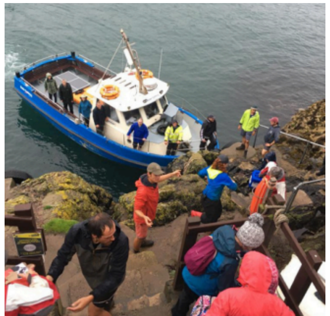
Forming a chain to move luggage

Your return journey to the mainland will usually leave Skomer around 9.30am.