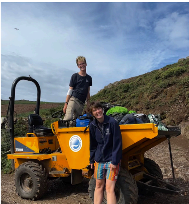
Packing the dumper for transport

As such, we're asking everyone to bring bags under 15kg as we've seen a big increase in recent years - many small and light ones are fine! If your bag is oversized, it will be left at the bottom for you to unpack to a suitable weight or carry yourself. We are legally bound to protect our staff, volunteers and visitors from injury and oversized bags can cause problems. Please note that where we have too many bags for the dumper, some may need to be carried.