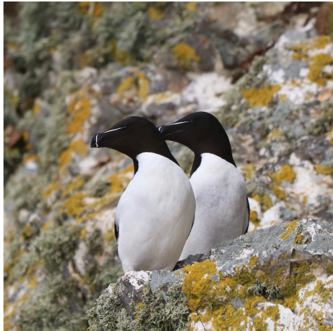
A pair of razorbills among lichen

Thank you again for supporting the Wildlife Trust of South and West Wales. We hope to see you again on our island home in the future.